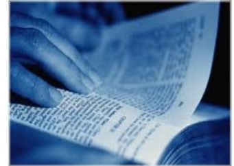
Respect God's Word

Matthew 23:1-12 —Woe to the Scribes and Pharisees.