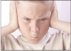
Honor thy father and mother Ephesians 6:2

The child who says, 'I will not' to his parents shows disrespect, dishonor, and discourtesy. He also rebels against the Heavenly Father who commands obedience to parents ( Luke 2:51 ; Colossians 3:20 ). Parents must teach respect for authority while children are young. If they do not, soci-