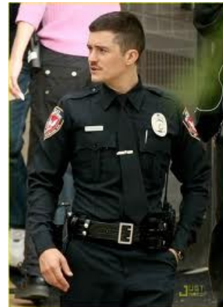
Respect For Authority